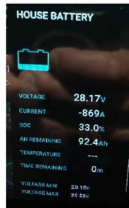
Figure 2 Battery at max current