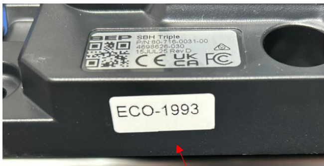
Figure 3 Location of part number on the product