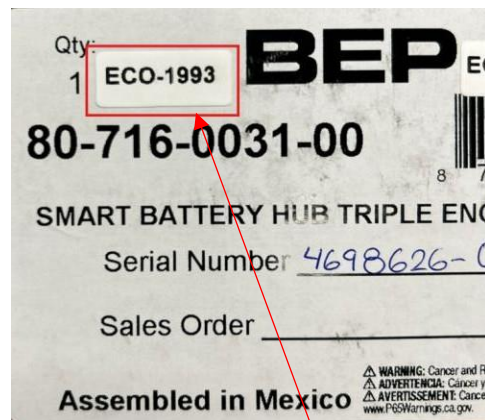
Figure 4 “ECO-1993” sticker on the box.