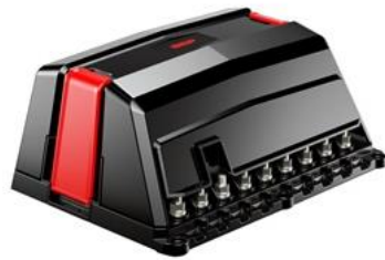
Figure 1 BEP Smart Battery Hub

Updated products have an “ECO-1993” sticker on the product (Figure 3) and on the outer