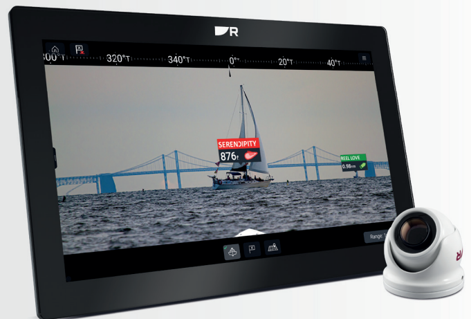
Augmented Reality with CAM300 and AR200 sensor